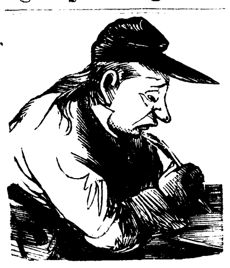
BREEF FUM SCHWEFFLEBRENNER.

SCHLIFFLETOWN, Jan. 11t, 1869. MISTER FODDER ABRAHAM: