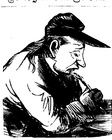
BREEF FUM SCHWEFFLEBRENNER. Schliffletown, Jan. 5t, 1869.