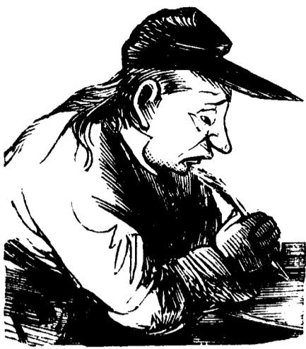
BREF FUM SCHWEFLEBRENNER.

SCHIFFLETTOWN, JULY der 13t, 1869. MISTER FODDER ABRAHAM: