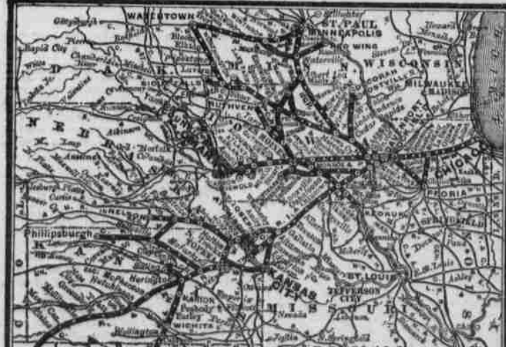
CHICAGO, ROCK ISLAND & PACIFIC R'Y.

JNACQUAINTED WITH THE GEOGRAPHY OF THE COUNTRY, WILL CHTAIR