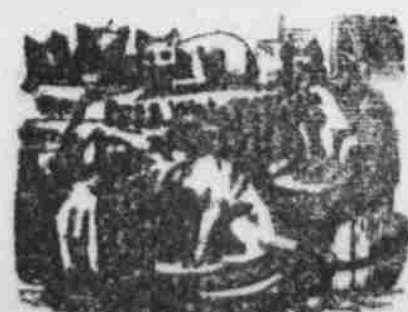
In a Boss Case

are undoubtedly the best. watch in a screw-dust case.