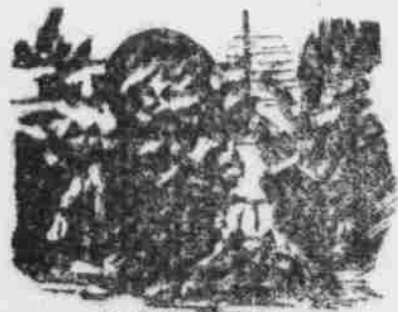
The Boss filled watches

WATCHES —All kinds. Gold: only the best makes. Gold-filled at any price you can name, from $12 to $50, or more, if you want a minute repeater.