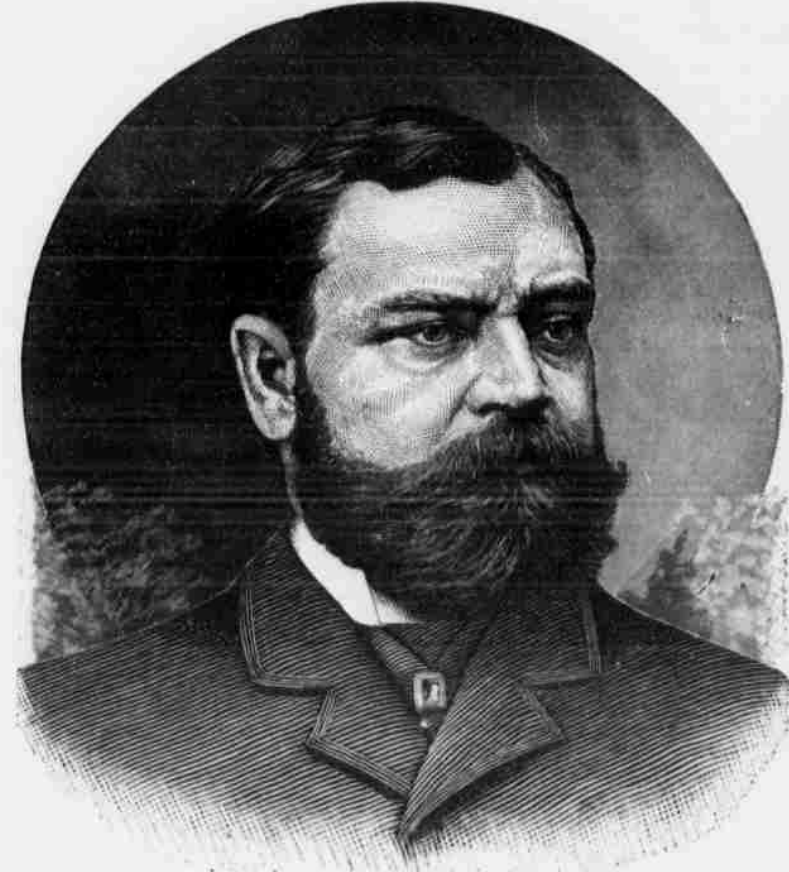
R. T. LINCOLN.