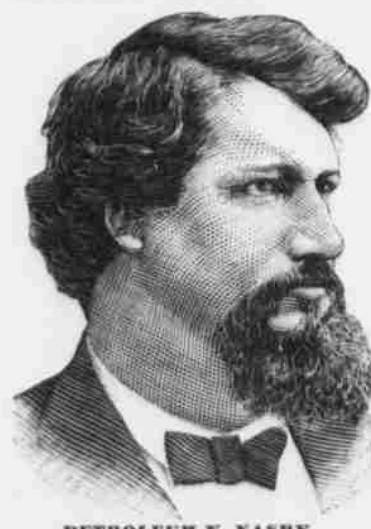
PETROLEUM V. NASBY, Journalist and Writer.