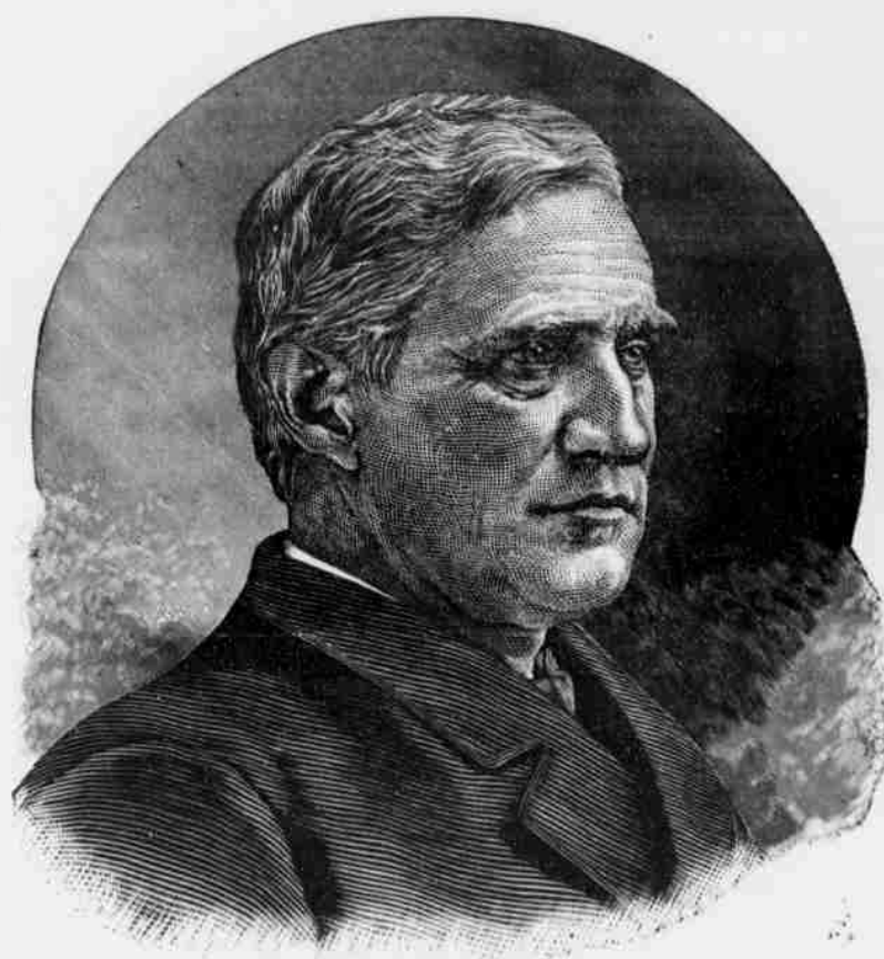
T. F. BAYARD.