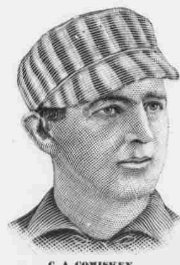
C. A. COMISKEY, Professional Base Ball Player.

Recognizing the fact that no good authentic portraits, from late photographs, of aspirants for the presidency have been published, we will issue in the same style as the larger engravings above, portraits of all the aspirants for the presidency. This series will include not only the prominent men, but the so-called "dark horses" will also receive our attention.