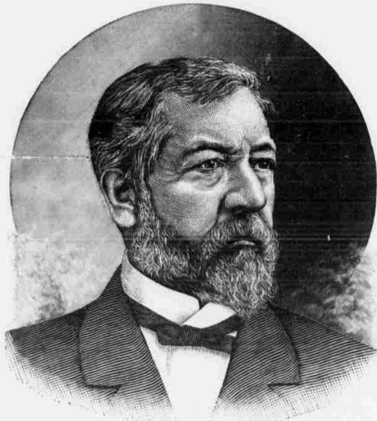
J. G. BLAINE