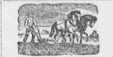
SEEDS BEST SOWN IN THE AUTUMN.

Most people have observed, no doubt, that self-sown seeds, that is, those that have dropped from the growing plants of the previous season, sometimes produced the most healthy and most fruitful plants that bloom the most freely. This is true of several kinds, and particularly of those that suffer under exposure to our mid-summer sun. The reason is, that self-sown seeds get a very healthy growth in the spring, vegetating as soon as frost is gone, and are good sized plants at the time we usually put seeds in the ground, even if they do not start in the fall. These plants, and flower during the weather of spring. The Clarkia and Nemophila and Annual Larkspurs are noted examples. There are several varieties of Hardy Annuals that do well with Spring sowing that will bear Autumn sowing in the open ground, and reward us with early Spring flowers. Sweet Alyssum and White Candytuft will give us a band of white for early cutting, if sown in the autumn. In a sandy soil the Portulaca may be sown in Autumn with good success. Seeds of Biennials and Perennials, if sown early enough to produce strong little plants, will flower the next Summer, and Pansies, Chinese Pinks, though they bloom the first Summer if sown in the spring, will make stronger plants and flower more freely and earlier if young plants are grown in the Autumn. In another place we give a list of seeds suited to fall planting even at the north. —Vicks Floral Guide.