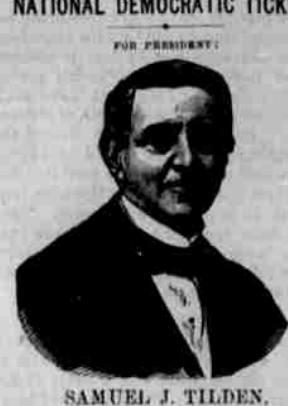
OF REST YORK.