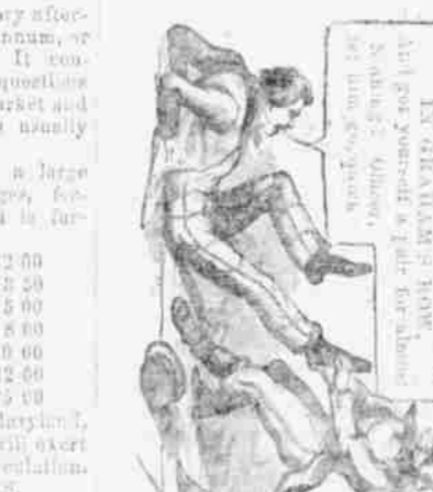
STEWART'S Shoe Shop. Always at MOSSOP'S.

Time of Passenger Trains at Duffield. Express Train leaves westward 12 00 P. M.