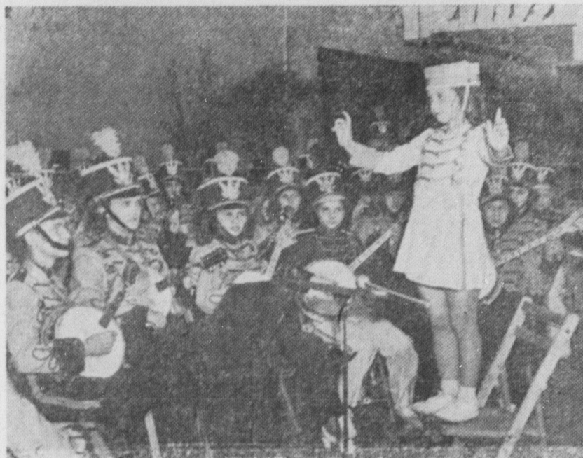
Bellefonte Banjo Band at the World's Fair, 1939.