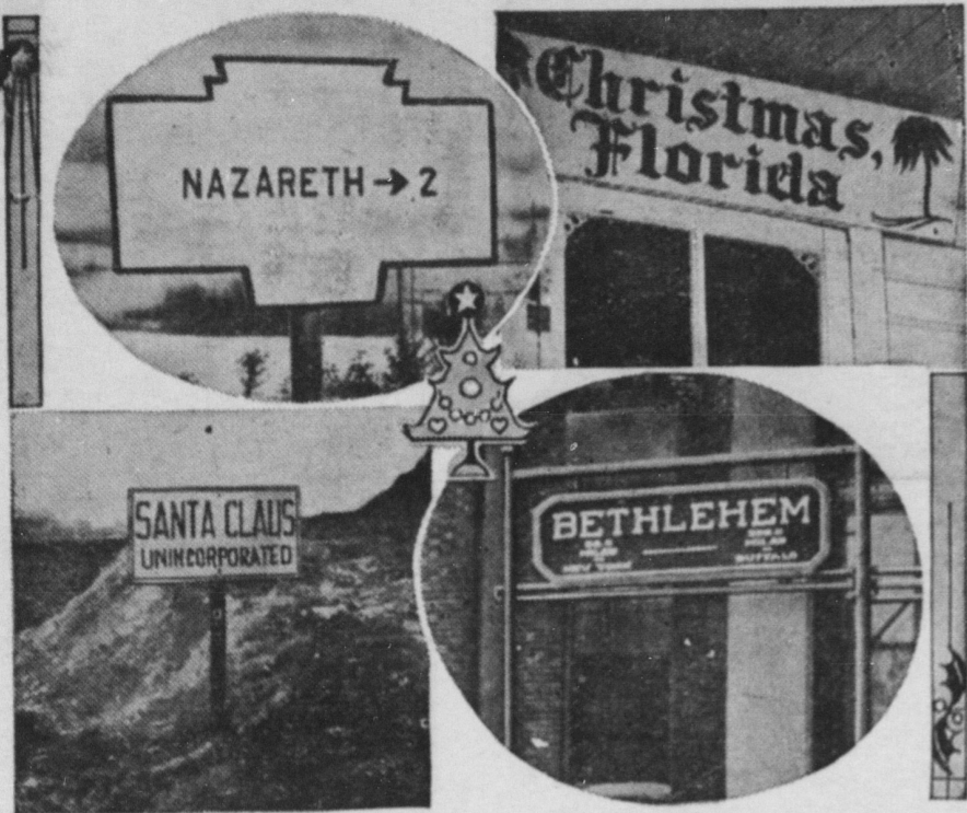
It's Christmas the year around where these pictures were taken: Christmas, Fla.; Bethlehem, Pa.; Nazareth, Pa., and Santa Claus, Ind. Each year thousands of Christmas cards are forwarded to postoffices at these communities for stamp cancellation.