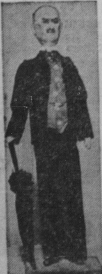
been made into dolls this year.

Neville Chamberlain-with-an-umbrella, the "appeasement" prime minister who claims to have kept Europe out of war last year, has become such a popular toy with British youngsters that the German toymakers, whose peace he "preserved," are griping. The Reich's doll manufacturers claim their exports to London have collapsed because Mr. Chamberlain-with-an-umbrella is the No. 1 favorite toy on the British Isles. Many other "men of destiny" have been made into dolls this year.