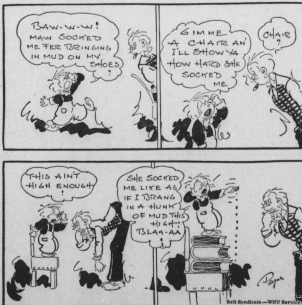
Bell Syndicate.—WNU Service.