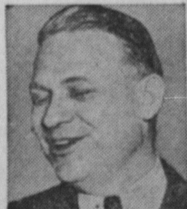
TEXAS' DIES He looked for reds.

DECEMBER 4: Unless member nations protest, the League of Nations, formed to keep Versailles' peace, will meet at Geneva while cannon are blasting.