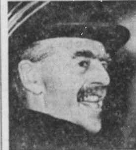
CHAMBERLAIN So was he.

Russia continued negotiations with Finland, but their nature remained mysterious. Finnish Foreign Minister Eljas Erkkö called "just as unfounded as all others" the latest report that Russia had demanded concessions in the Gulf of Finland, a friendship policy between the Kremlin and Finland, and destruction of all fortifications in the strategic Aaland islands. Some observers believed Russian demands on Finland were increased to offset the Soviet's diplomatic defeat in Turkey. But it remained unlikely that Russia would invade Finland.