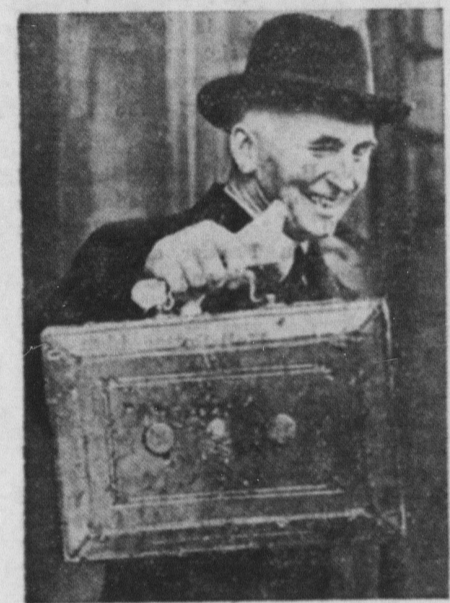
SIR JOHN AND BUDGET U. S. taxpayers can be thankful.

Great Britain entered the World War in 1914 with a 649,000,000-pound debt, raised her tax rate to six shillings in the pound (or 30 per cent) and probably spent 11,076,000,000 pounds (about $55,000,000,000) to lick the Kaiser. In 1939 Britain's record peacetime budget was 1,322,444,000 pounds, of which 380,000,000 pounds was to be borrowed. Most of this was for defense, but what bothered Britishers most on September 1, when they declared war on Adolf Hitler, was their current public debt of 8,200,000,000 pounds, 13 times greater than 1914's.