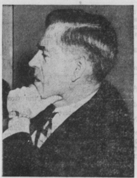
SECRETARY WALLACE Uncrossed his fingers.

Not until early August did Mr. Wallace uncross his fingers. Then,