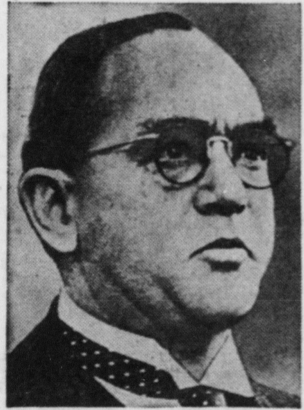
SOUTH AFRICA'S PIROW He expressed Britain's sympathy.

Though Christian Great Britain is horrified by Hitler's persecution, it dares not slap Germany's face.