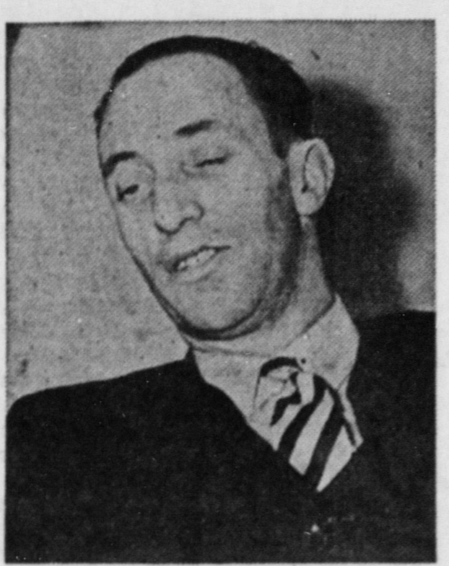
ALIEN HARRY BRIDGES Even C. I. O. became hostile.

C. I. O. (now the Congress of Industrial Organization) has made at least two important bids for conservative support.