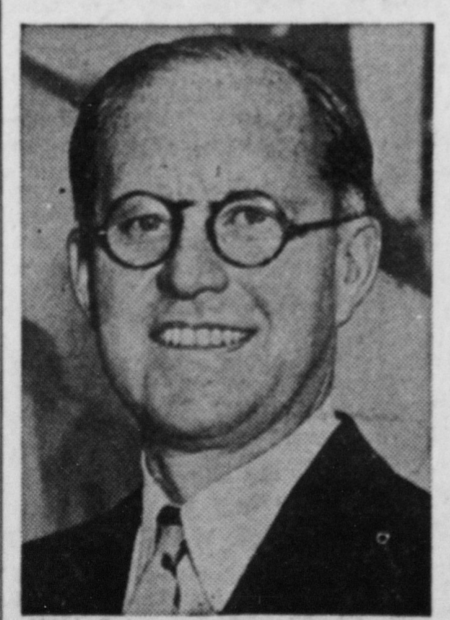
AMBASSADOR KENNEDY For German Jews, a solution.

(2) U. S. indignation over Germany's Jewish persecution has found expression in the plan put forth by Joseph P. Kennedy.