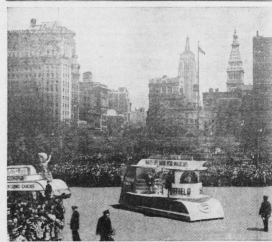
NEW YORK—It is a dull day when New York does not have some sort of a parade. Pictured above is scene at 23rd Street and Broadway during Motorcade and Preview of the New York World's Fair 1939. In the background is the tower of the Empire State Building. All floats in this parade were on wheels. The procession ended in the fair grounds where half a million people were assembled.

The Centre Reporter, $1.50 a year. Is your subscription due?