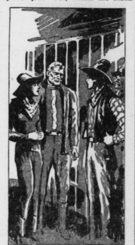
Then "Speak Out, Man!" He Said

It seemed strange, Billy Wheeler thought, that the old king of cattle, the man who could not only dream a cow kingdom but make it live, was to be found standing here in a two-by-four jail. Yet, within the black