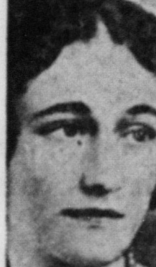
Duchess of Windsor

EDWARD , duke of Windsor, and Mrs. Wallis Warfield, the American woman for love of whom he gave up his throne, were married in the Chateau de Candé, Monts, France, and are now spending their honeymoon at Wasserleonburg castle in lower Austria.