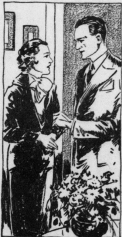
"I Say, Stop This Nonsense," He Admonished Her Sternly.

have been correct," he said. "But it happens that Swift did not commit suicide." The nurse's eyes opened wide. Her face paled perceptibly. "You mean someone shot him?" Her words were barely audible. "But who—who—?" "We don't know," Vance's voice was matter-of-fact. "But we must find that out . . . Would you like to help me, Miss Beeton?" She drew herself up; her features relaxed; and she was once more the unperturbed and efficient nurse. "I'd be very glad to." "Then I would like you to stand guard, as it were," he said, with a faint friendly smile. "I want to talk to Mr. Garden, and I don't want anyone to go upstairs. Would you mind taking your post in this chair and notifying me immediately if anyone should attempt to go up?" "That's so little to ask," the girl replied, as she seated herself in a chair at the foot of the stairs. Vance thanked her and proceeded to the den. Inside Garden and Zalia Graem were sitting close together on a tapestry davenport and talking in low, confidential tones. An indistinct murmur of voices from beyond the archway indicated that the other members of the group were in the drawing-room. "I've called the district attorney, and he has notified the police. They should be here any minute now. In the meantime, I'd like to see you alone." He turned his head to Miss Graem and added: "I hope you won't mind." The girl stood up and arched her eyebrows. "Pray, don't consider me," she