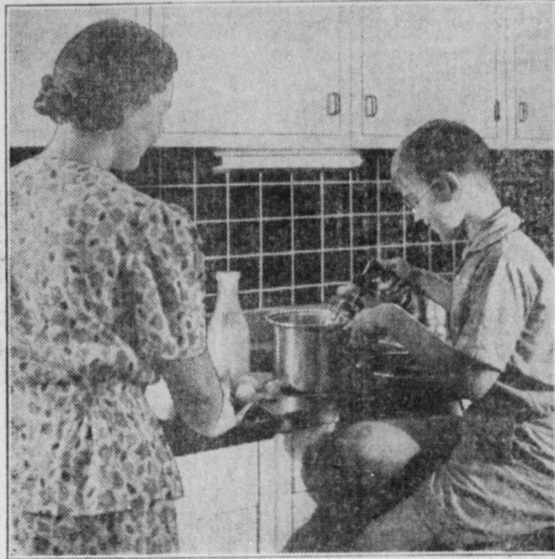
Boys, as well as girls, are invading the kitchen nowadays and finding out that cooking is fun