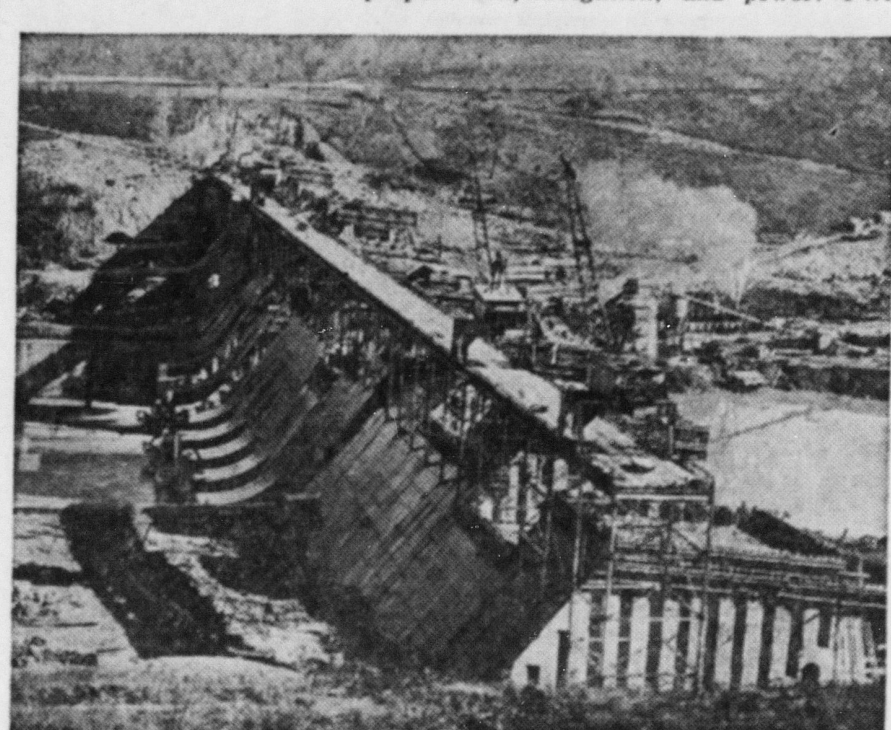
Tygart river dam at Grafton, W. Va.

Water impoundments within the United States, requiring the assistance of the public works administration, have taken place for five principal reasons: Water for human consumption, flood control, navigation, irrigation, and power. PWA