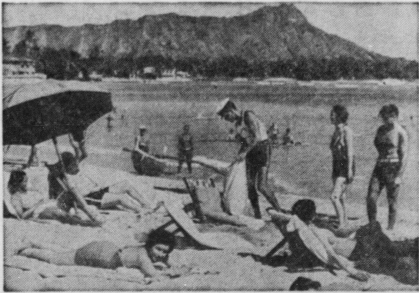
In the shadow of Diamond Head, happy bathers frolic on the beach at Waikiki. Concealed in an extinct crater in Diamond Head are a number of the big guns that defend Honolulu, Pearl Harbor and the island of Oahu.

These defenses are manned today by 25,000 of America's fighting force. Twenty thousand of these