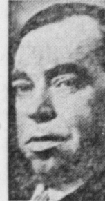
Irvin S. Cobb

In between, somebody is either trying to put Sister Aimee McPherson in a hole or get Tom Mooney out of jail. So far, neither undertaking has succeeded, but folks keep right on trying. Last month, it was Sister Aimee's turn. This month it's Tom Mooney's.