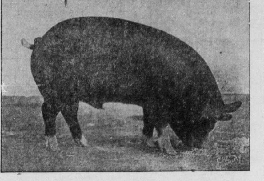
Grand Champion Barrow, International Livestock Show, 1936

BERKSHIRES SWEEP MARKET HOG CLASSES AT INTERNATIONAL. Winning five out of six interbreed championships over all breeds, Berkshires set an all-time record at the recent International Livestock Exposition held at the Union Stock Yards, Chicago.