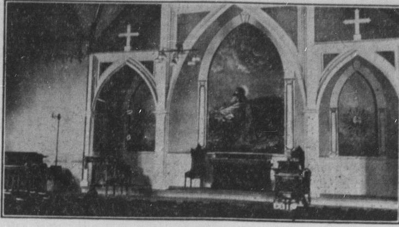
Interior St. Luke's Evangelical Lutheran Church - Plate 5 'x 7'