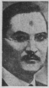
Rep. S. B. Hill

CONGRESSMAN SAM B. HILL of Washington and his subcommittee of the house ways and means committee took up the heavy task of determining how the new revenue of $1,137,000,000 called for by President Roosevelt should be raised.