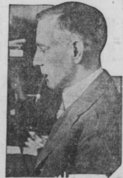
EDWARD W. PICKARD Famous Commentator Who Writes "Weekly News Review"

WANTED—Market chickens of all kinds; tankage sold, $1.75 per cwt.—A. M. Reigel Centre Hall; phone 11 R2.