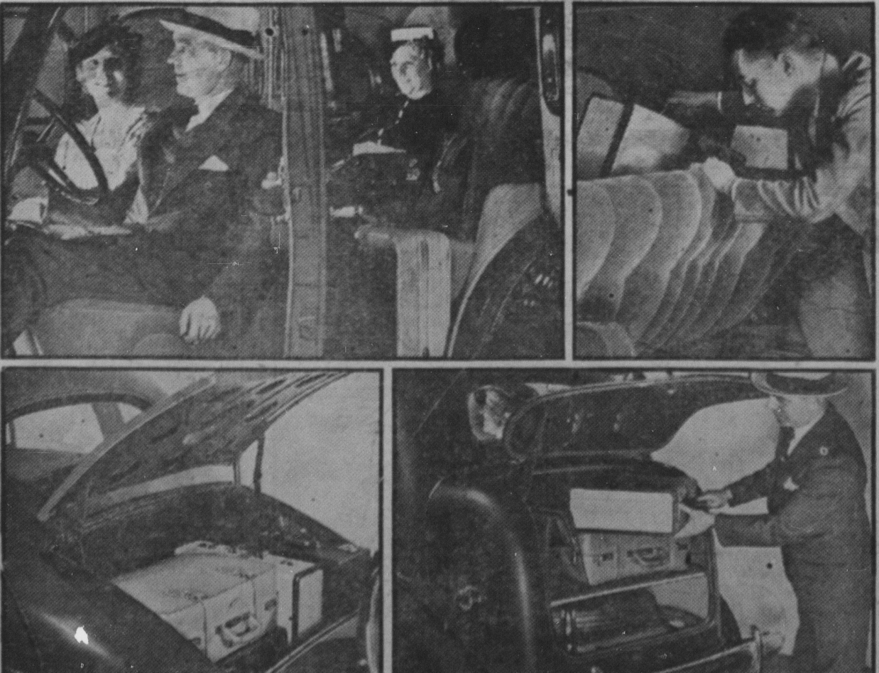
Comfort, pleasure, and safety on a tour depend largely on efficient loading of the luggage, and modern body designs have done much to ease the problem, as these views of Chevrolet models reveal. In the upper left view, the suitcases have been fitted in snugly, the adjustable front seat having been moved forward to allow extra leeway, and the driver is now pushing back the seat to clamp the bags in place for the day. Upper right, the tourist is utilizing the baggage space back of the rear seat. The two lower pictures show the loading of a coupe compartment and a sedan trunk.

You are entitled to ALL THESE FEATURES when you buy a low-priced car