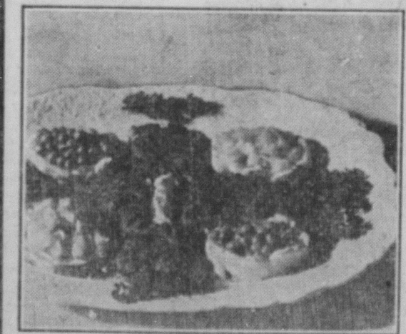
A delicious meat and vegetable plate prepared in the thrift cooker.

TERMS TO SUIT YOU! ELECTRIC RANGES prices from $79.50 INSTALLED