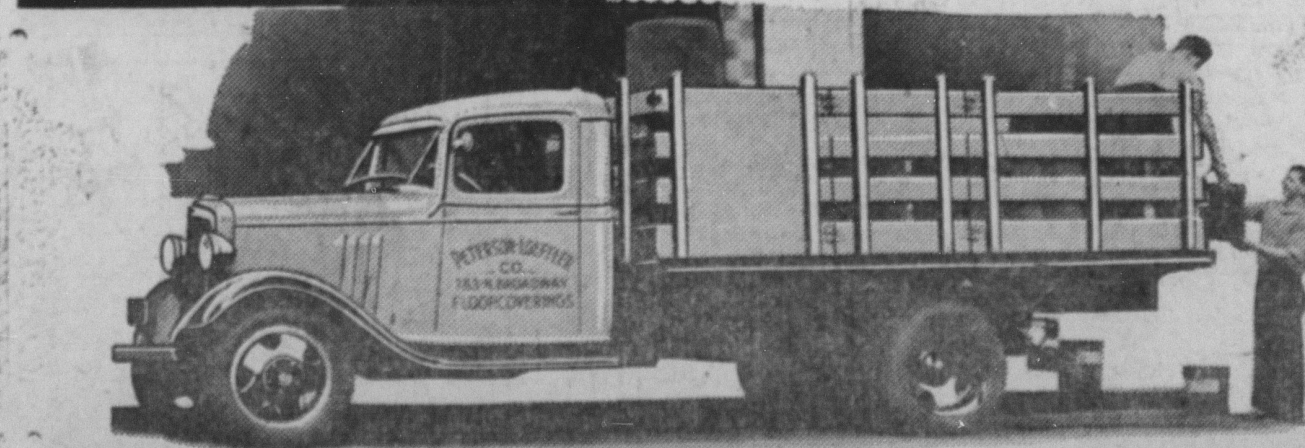
*1 1/2-Ton Stake, $720 (157" Wheelbase)

Above are list prices of commercial cars at Flint, Mich. Special equipment extra. *Dual wheels and tires $20 extra. Prices subject to change without notice.