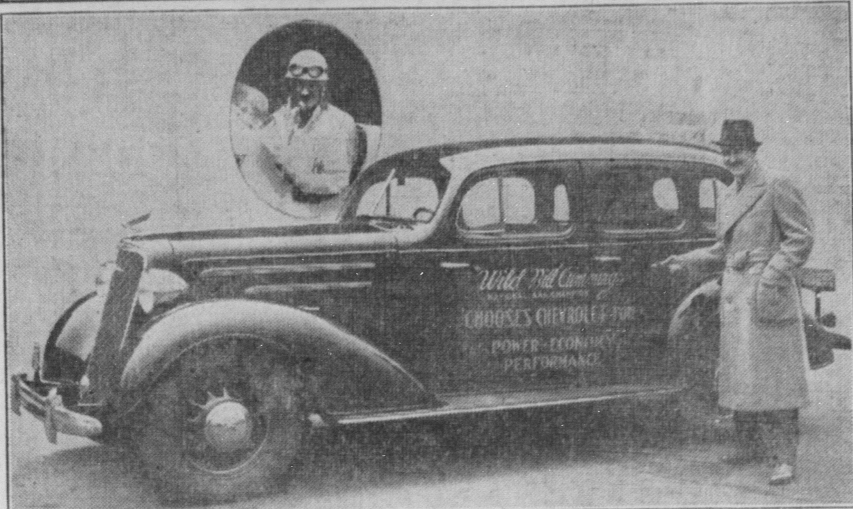
"Wild Bill" Cummings, national A. A. A. racing champion, recently took delivery of his second Chevrolet—a new 1935 Master De Luxe sedan with which he is pictured above. Cummings became a Chevrolet owner following his victory at Indianapolis last Decoration Day. In the oval he is shown as he finished the Indianapolis classic, wearing the new type crash helmet that was recently adopted by the A. A. A. Contest Board for all racing drivers in 1935.