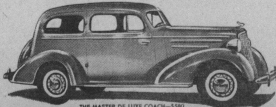
THE MASTER DE LUXE COACH—$580

The aristocrat of low-priced cars . . . longer, even larger, beautifully streamlined . . . the only car regardless of price that brings you all of the following quality advantages: Turret-Top Body by Fisher (with No Draft Ventilation) . . . Improved Knee-Action Ride . . . Blue-Flame Valve-in-Head Engine with Pressure-Stream Oiling . . . Weatherproof Cable-Controlled Brakes . . . True Shock-Proof Steering.