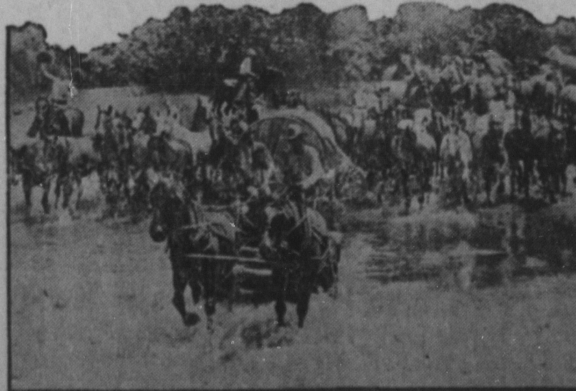
Here is seen the traditional chuck wagon of the Old West crossing the Molalla river in Oregon followed by wild horses during one of the longest and largest round-ups of wild horses in the state. The herd was driven 450 miles over streams, deserts and mountains.