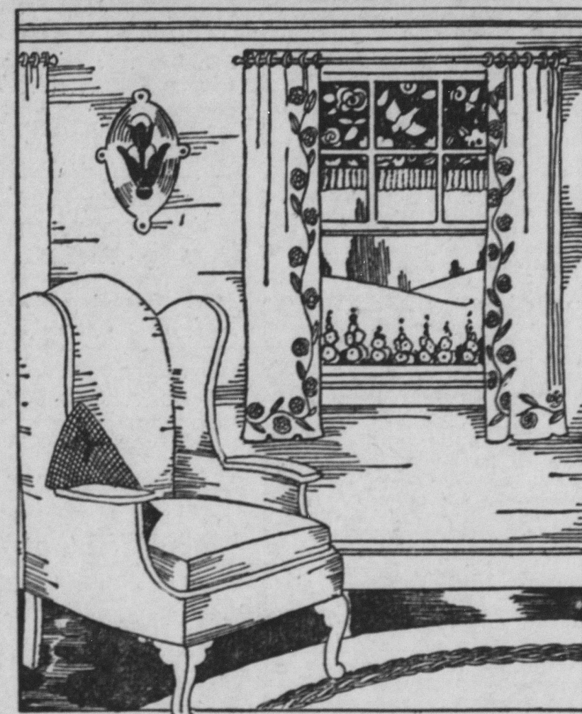
The Inside of This Awning Lends Decoration to the Interior Since It Is Gaily Painted in Flowers and Birds.

THE intense heat of summer made many householders consider having awnings for windows which have been left unprotected hitherto. From the standpoint of economy, now is a good time to do this work since there are excellent opportunities to buy awnings, ready to put up, at decided reductions, and awning cloth very specially priced. By having the windows done now, the awnings will be ready for next year as soon as the heat of the sun and the glare becomes uncomfortably strong. It is a fortunate replacement time—if you get advance styles.