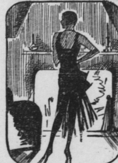
The Girl-Friend says she wouldn't marry an X-ray specialist; she hates men who can see through her.