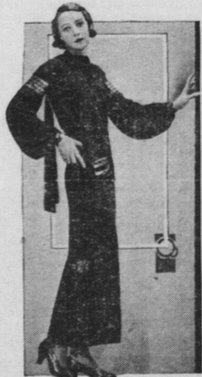
This charming afternoon dress, by Ardamee of Paris, is in black marocain crepe. The waist, sleeves and scarf are trimmed with steel embroidery.