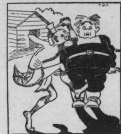
Taking his tomahawk the Indian went from place to place in the camp scalloping the people.

BONERS are actual humorous tid-bits found in examination papers, essays, etc., by teachers.