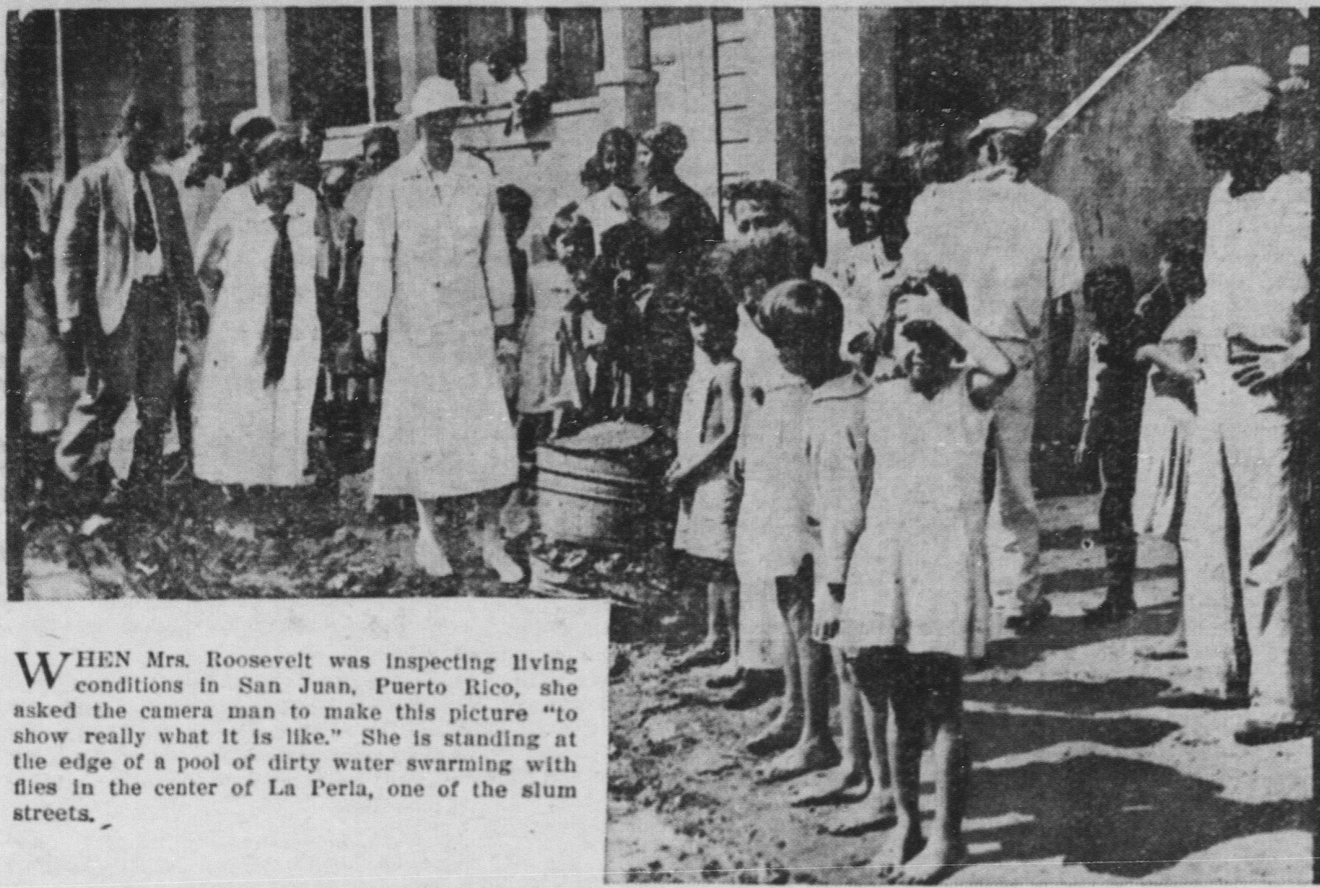
WHEN Mrs. Roosevelt was inspecting living conditions in San Juan, Puerto Rico, she asked the camera man to make this picture "to show really what it is like." She is standing at the edge of a pool of dirty water swarming with flies in the center of La Perla, one of the slum streets.