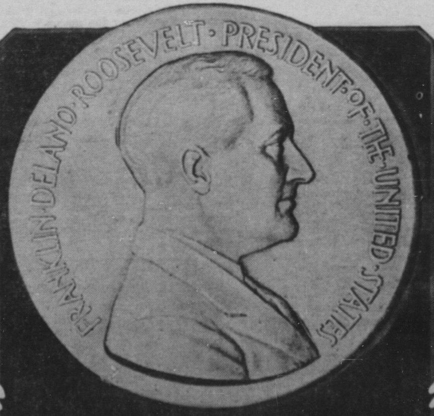
BRONZE medals bearing a portrait of President Roosevelt, and the Presidential seal on the other side, are offered to the public at $1.00. Mr. Roosevelt approved the design and the Philadelphia mint struck off the medals.