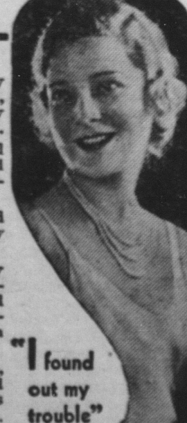
"I found out my trouble"

S.S.S. value has been proven by generations of use, as well as by modern scientific appraisal. Sold by all drug stores... in two convenient sizes... the larger is more economical.