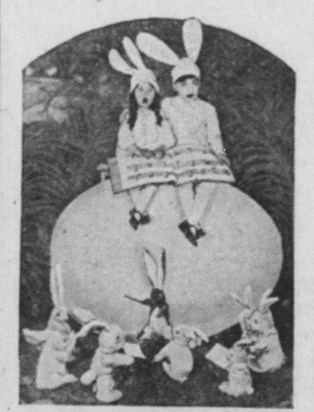
A Duet With Bunny Orchestra.

The origin of egg-rolling which most youngsters enjoy so much, says Pathfinder Magazine, is supposed to have begun centuries ago from the practice of farmers rolling eggs over their land to be sure of abundant yields at harvest time. This was because the egg was pagan emblem of the germinating of life of early spring. The children are told that the rabbits lay the eggs, and for that reason the latter are nearly always bidden away in nests or in flower beds in the yard and garden. The rabbit is another pagan symbol and has always been an emblem of