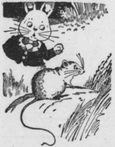
"Have You a Pocket?" Peter Demanded.

"YES, indeed," continued Nimbleheels, "I take the very greatest care of my tail. The way I feel about it is that I might just as well lose my life as my tail. I probably would anyway." "Probably would what?" asked Peter, looking puzzled. "Probably would lose my life, of course, if I should lose my tail," re-