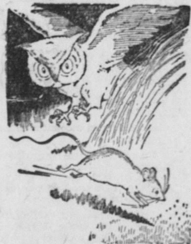
Hooty Struck With His Great Curved Claws, but He Was Too Slow.

Nimbleheels was so intent on his jumping that he didn't see that shadow