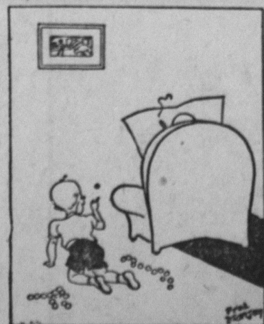
"Pop, what is economics?" "Playing marbles."

late, as he struck savagely with his great cruel-looking claws.