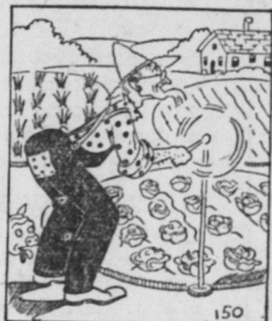
Farmers rotate their crops so that they may get sun on all sides.

BONERS are actual humorous tid-bits found in examination papers, essays, etc., by teachers.