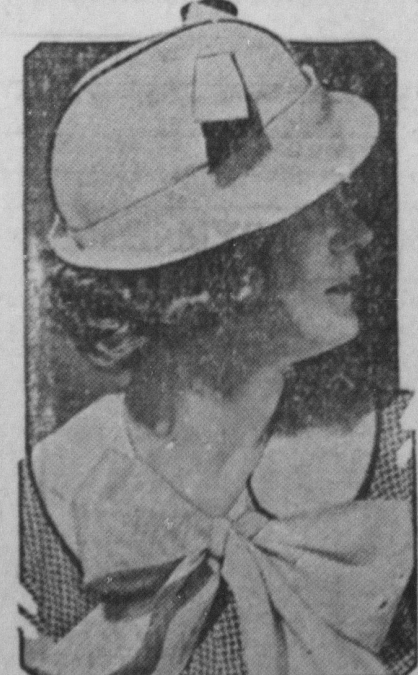
The blown-to-the-front movement in crowns is developed by Molyneux in this polka-dotted alpaca straw, one of the sensations of the season. The collar set is made to match the hat.