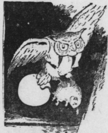
Hanging Head Down, He Gazed at His Beloved Smiling Pool.

more quickly when occasion demands. You would have thought so if you could have seen him flailing that dive in the moonlight. But quick as he was, he wasn't quite quick enough. No, sir, he wasn't quite quick enough. Those great reaching claws were just ready to close when he dived and they did close. Only Jerry's hands and head reached the water he was frantically diving for. Then he squealed with pain and terror as he was lifted and, hanging head down, was carried across the Smiling Pool. Hooty the Owl had spoken truly when he said "I've got you now." Poor, poor Jerry Muskrat! Hanging head down, he gazed at his beloved Smiling Pool for what he believed to be the last time. Those claws hurt dreadfully. Then being carried head down made him feel as if his heart and stomach and everything else inside him had slipped out of place. His beautiful new house would never be finished. This was the last he would ever see of all the things he loved so. He had been caught at last, and all through his own carelessness. To make Hooty the Owl, for whom he had so long been too smart, a dinner was to be his end. Poor, poor Jerry Muskrat!