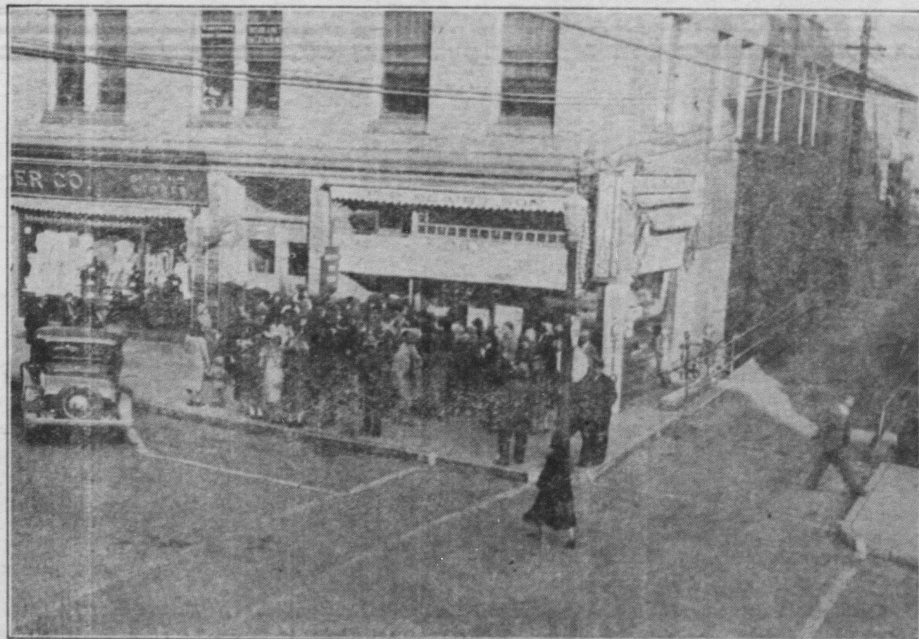
Store Constantly Jammed (Insert shows crowds continually clamoring for admission)

All prices f.o.b. factory. Convenient time-payments.