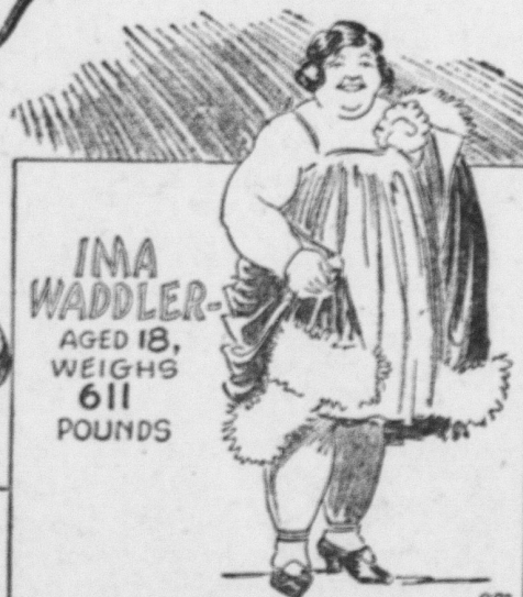
IMA WADDLER AGED 18, WEIGHS 611 POUNDS