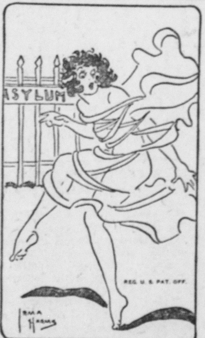
"The inmate who has half a mind to escape should consider that finders are keepers."