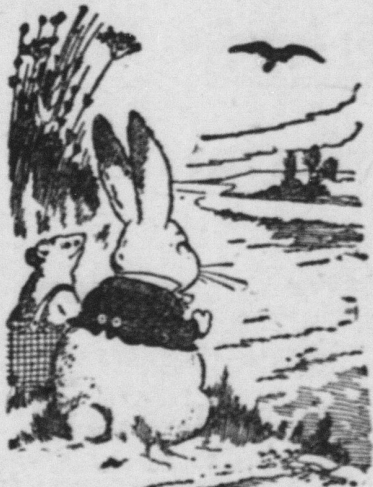
"Just as if we honest people haven't enough worries as it is," grumbled Peter, as he watched the stranger flying toward the Big River.

EARLY this spring there had come in the Green Forest a stranger who had once aroused a great deal of suspicion, not so much because of what he did but on account of his looks. Perhaps some of you will remember the suspicion with which Ol' Mistah