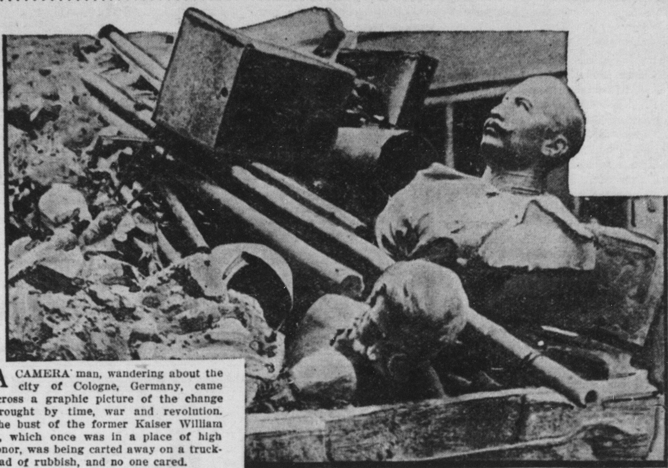
A CAMERA man, wandering about the city of Cologne, Germany, came across a graphic picture of the change wrought by time, war and revolution. The bust of the former Kaiser William II, which once was in a place of high honor, was being carted away on a truck-load of rubbish, and no one cared.