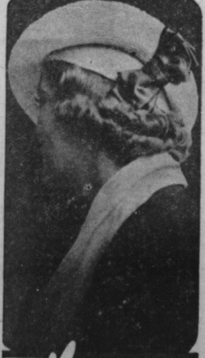
Here is one of the new spring hats, of lustrous white pearly straw, showing the new back bandeau treatment which tilts the hat down over the face in almost a straight line.