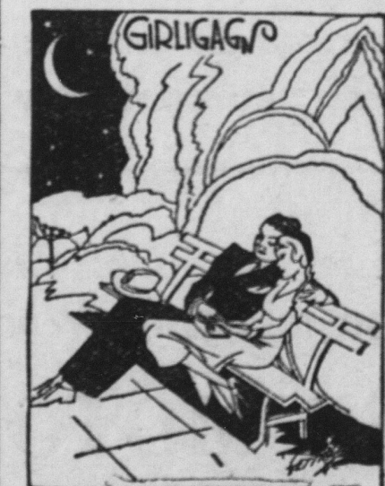
"A woman's idea of an entertaining man," says observing Olivia, "is one who can say 'Um-humph' with an animated expression."

Danny Meadow Mouse quite agreed with Peter. So did all the birds. Reddy Fox and Old Man Coyote felt much the same way toward the stranger, only for a very different reason. "That fellow will make our hunting all the harder," grumbled Reddy to Granny as they watched the stranger. "The more there are to hunt, the harder the hunting. Somebody ought to send him back where he came from." Granny was watching the stranger sharply, and pretty soon she caught