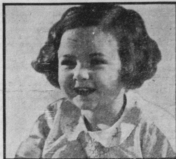
HAPPY little girl, just bursting with pep, and she has never tasted a "tonic!"

Every child's stomach, liver, and bowels need stimulating at times, but give children something you know all about.