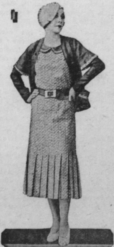
Printed and plain linen in an effective ensemble from Birke and Birke. The hat from Howard Hodge.