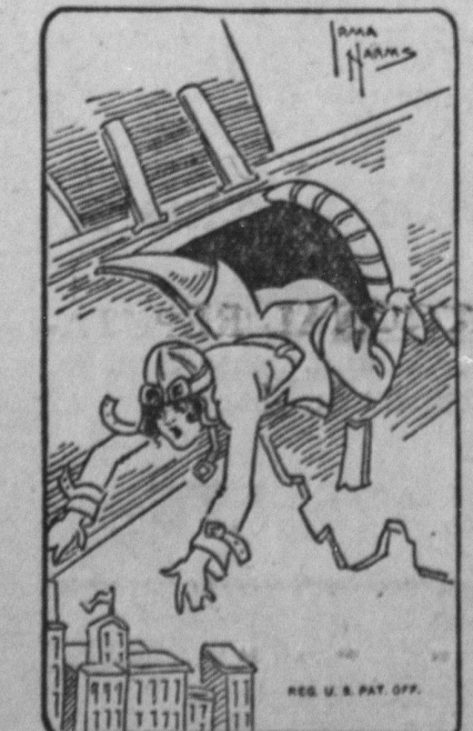
"Crash suits are fashionable and practical for amateur flyers."