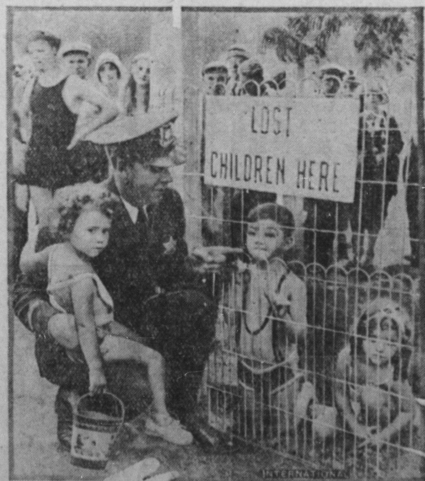
During the hot weather many children are lost in the parks of the big cities and at the bathing beaches. At the Oak street beach in Chicago, this became such a problem that the park board erected a wire-fenced enclosure, where the lost little ones are kept until called for by their parents.