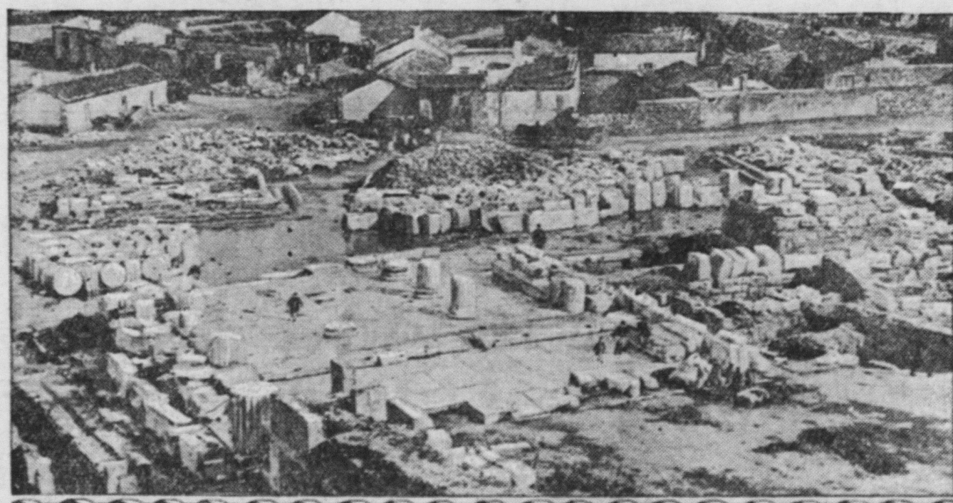
The temples at Eleusis, near Athens, where the great festivals and mysteries in honor of Demeter were celebrated, as they now appear after the clearing of the ground which has covered them for nearly 2,000 years.

that the young woman was agreeable, that the show was pleasing, or that the argument went his way.