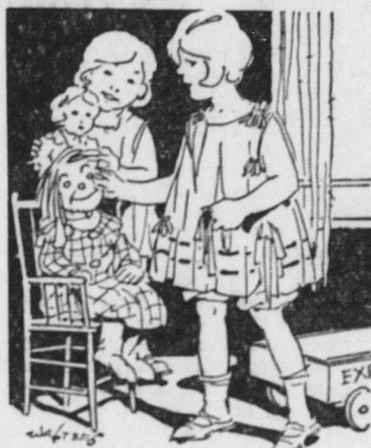
"Every Mother Had Been So Proud of Her Children."

After the party was over and Mrs. Cucumber Green's children had been covered up with the blanket in the