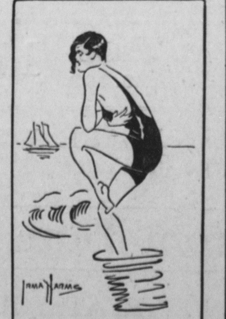
"Even an actress who can swim refuses to be cast in 'Muddy Waters.'"