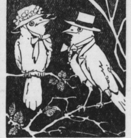
"We Are a Sociable Crowd," Said Mrs. Blackbird.

then, oh, chack, chack, chack," the birdlings answered.