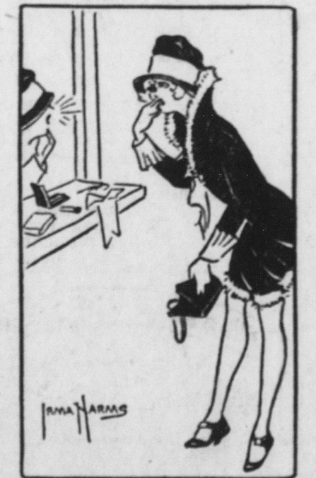
"The lost compact produces a shining example of carelessness."