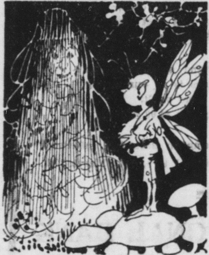
"Not in the Least, I Am Not Sensitive," Said Nurse Fog.

"I T'S a splendid life," said Nurse Fog, "as it's so exciting." "Maybe you wouldn't think it exciting, but I do, at any rate." "I should think at times," said Billie Brownie, "you'd become tired of hanging so heavily over the water and over places." "Oh, no," said Nurse Fog, "I love it. You see, I have friends and relatives and there are my raindrop charges." "Have you many friends?" Billie Brownie asked. "To be sure," said Nurse Fog. "I shall tell you about them if you would like to hear," she added. "I would indeed," said Billie Brownie. "In the first place," said Nurse Fog, "I always come around when warmer air begins trying to play with