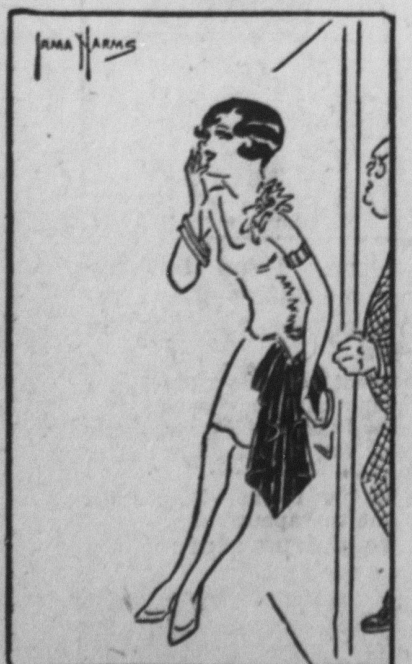
"All is not old that titters."