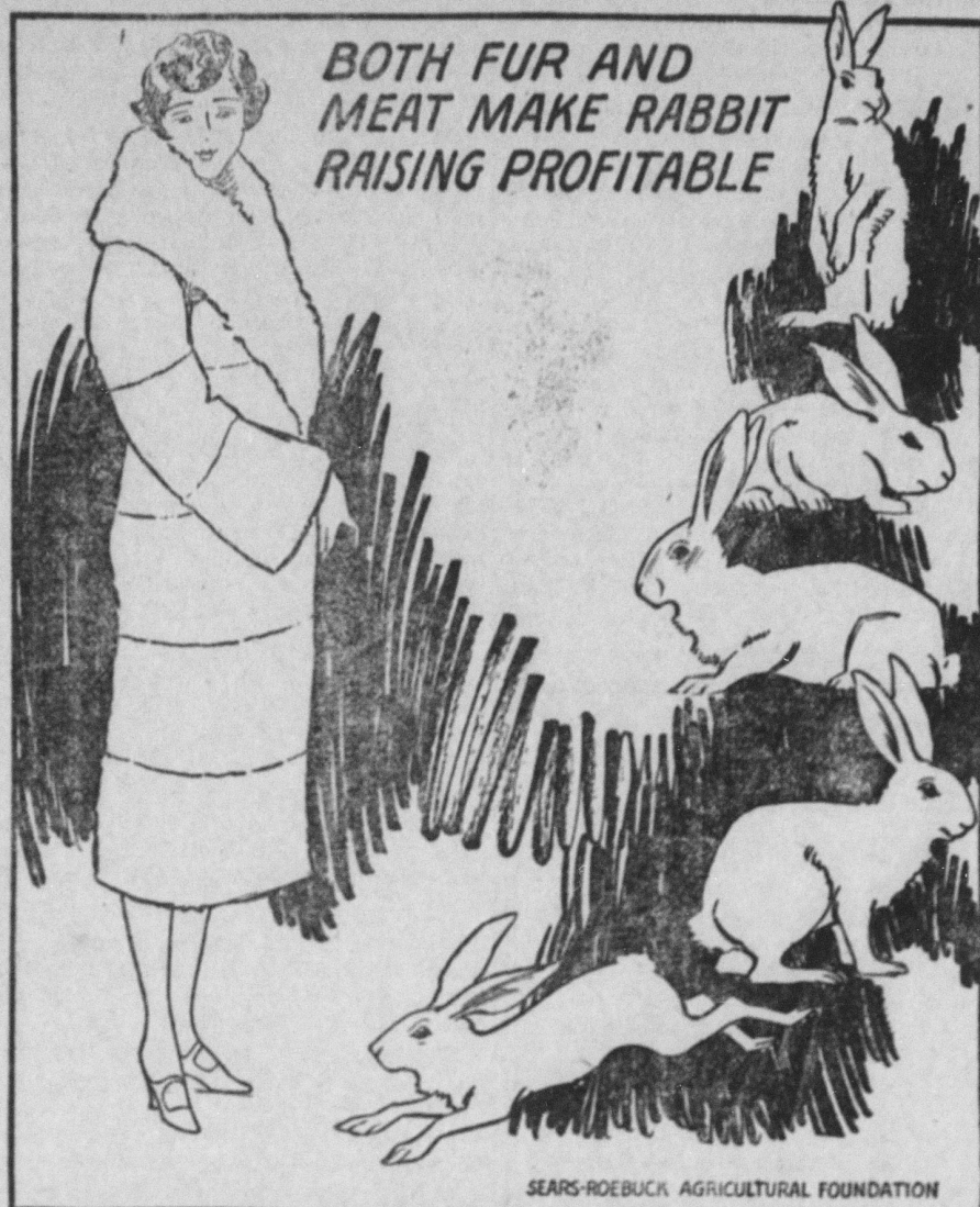
SEARS-ROEBUCK AGRICULTURAL FOUNDATION

Money is being made with rabbits on many farms, says the Sears-Roebuck Agricultural Foundation. The rabbit raising industry undoubtedly has a great future.