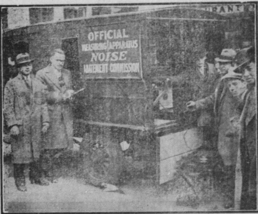
Technicians from the Bell Telephone Laboratories are shown measuring the deafening effects of noise in New York, in connection with studies being made by the Noise Abatement Commission...