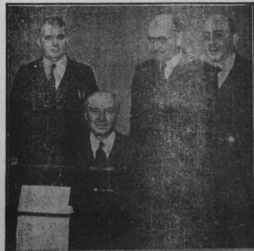
Governor Fisher is shown sitting at one of the transmitting machines in State Police Headquarters, Harrisburg, at the opening of this high-speed communication system, which links together the police units of 95 cities and towns throughout the State...