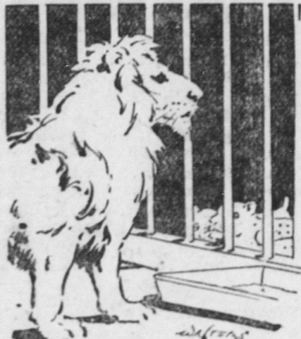
"Belong to the Family Known as the King of Beasts."

"You must speak for yourself in this life. Do you suppose we would always have been known as the King of the