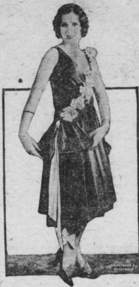
Showing a late model in a dinner frock for the college coed. The full and very uneven skirt is lined with white taffeta, as is the large bow at the side. The neckline is accentuated with a row of gardenias. Black satin slippers with large rhinestones are worn.