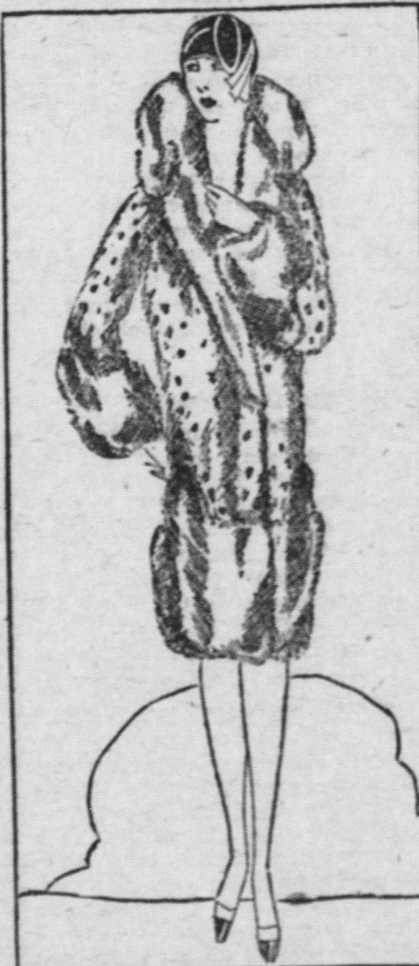
Sports Coat Made of Leopard and Trimmed With Beaver.

Furs are of many kinds, and it is well to realize that there are good