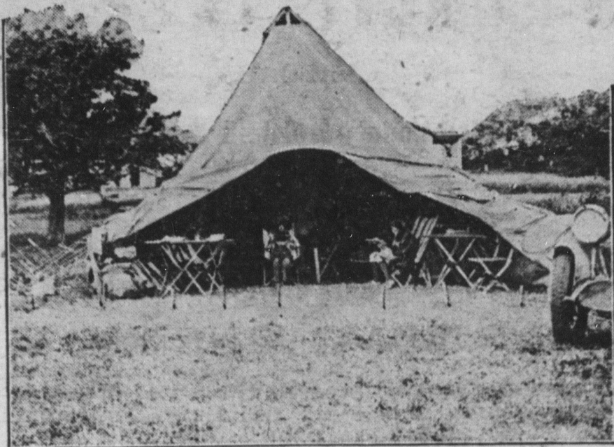
Typical Canadian Summer Camp.

Motor touring, the summer pastime of millions, is pleasant directly in proportion to the manner in which the car performs. In the view of officials of the American Automobile association. It is estimated that 44,000,000 persons will take annual vacations this year on the open road.